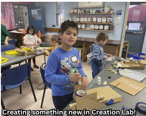
Creating something new in Creation Lab!