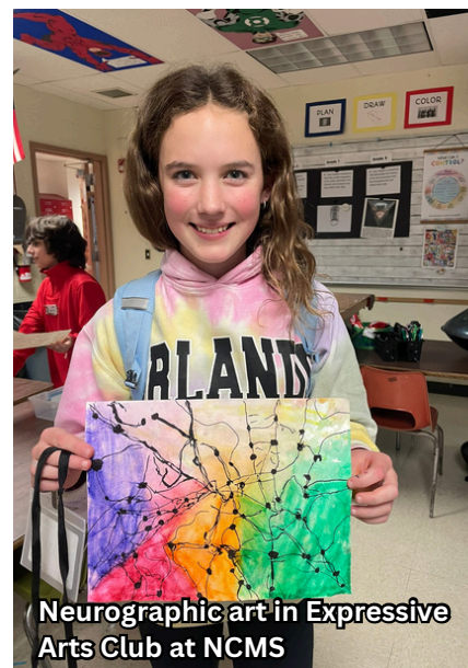
Neurographic art in Expressive Arts Club at NCMS