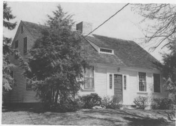
House (c. 1800); Sneece Pond Road; Arnold Mills