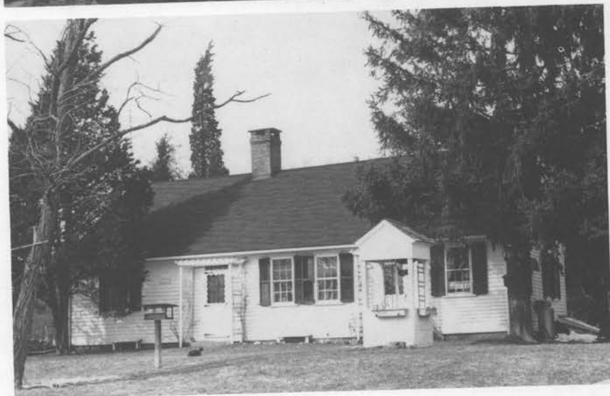
Luke Jillson House (c. 1752, et seq.); 2510 Mendon Road