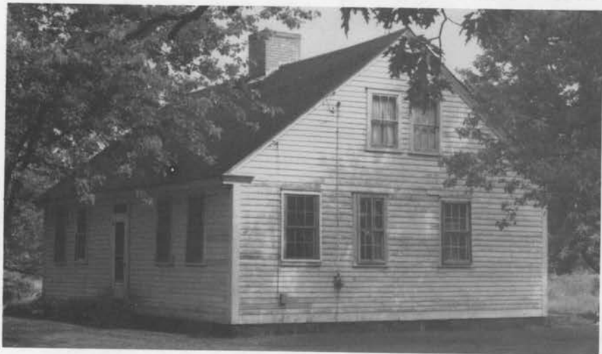
G. Whipple Store (late 19th century); Diamond Hill Road