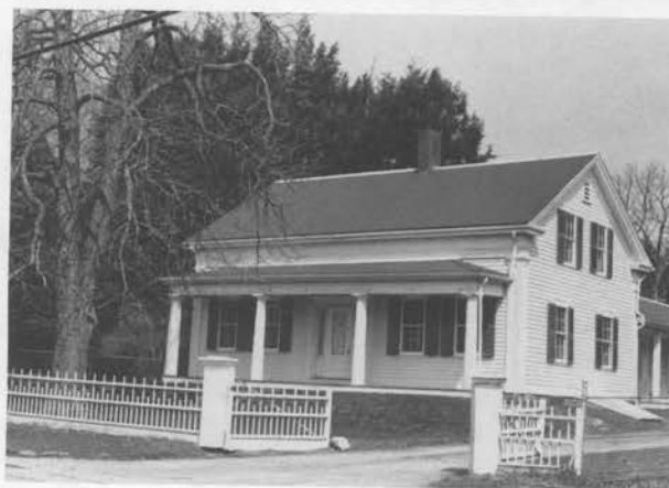
Dr. Addison Knight House (c. 1844-46); Sneece Pond Road, Arnold Mills