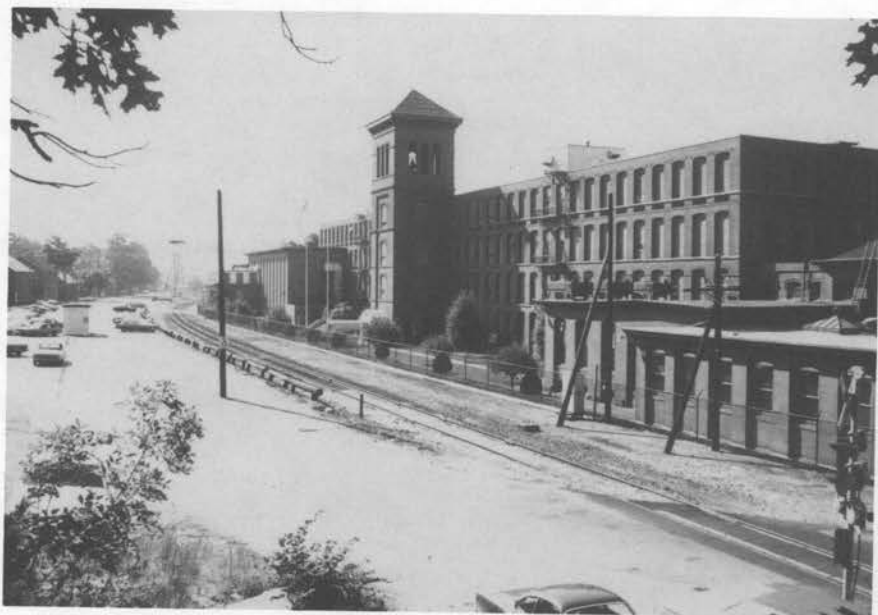
Ashton Mill Workers Housing (1870s); Ashton