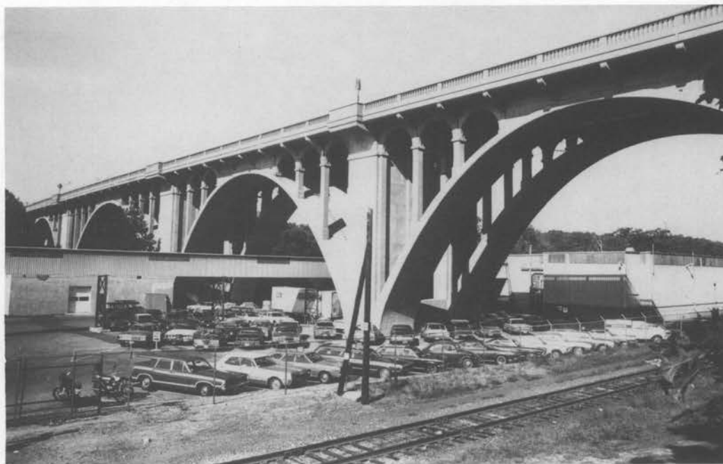
Ashton Viaduct (1934-45); George Washington Highway