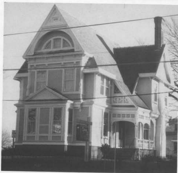
Town Hall (1894); 45 Broad Street