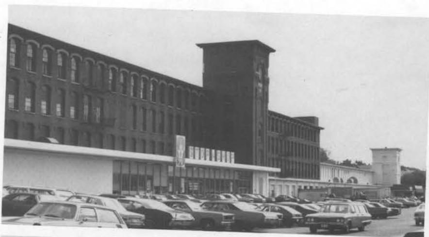
Mill Housing (1870s); Lonsdale