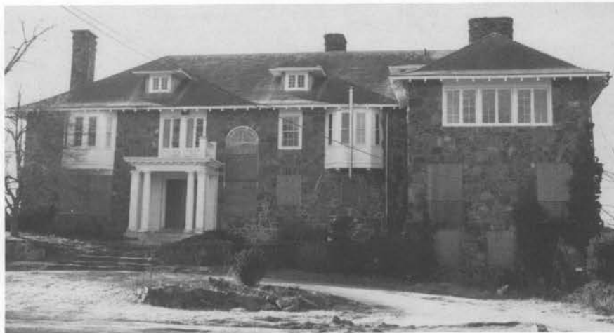
Gray Rock (1920); 160 Angell Road