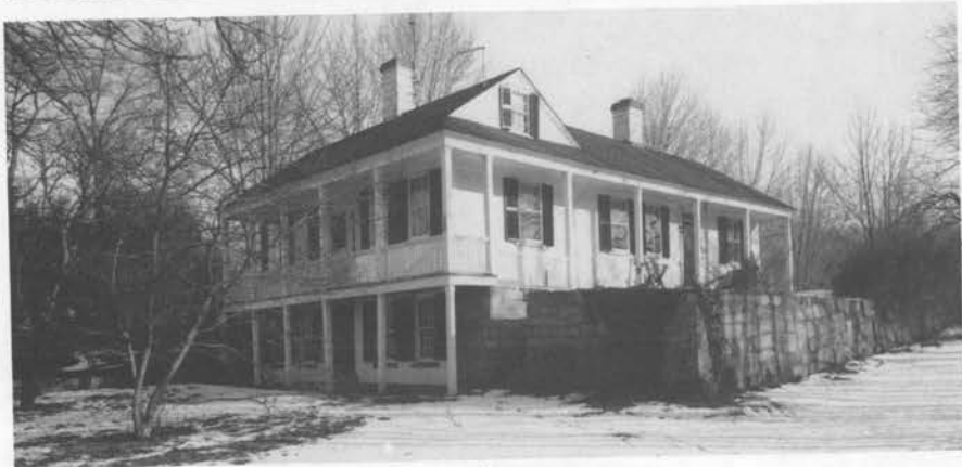
Cyrus Cook House/Orchard House (1810); (Old) West Wrentham Road