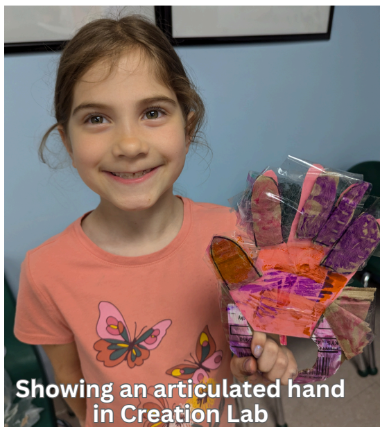
Showing an articulated hand in Creation Lab