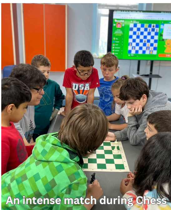
An intense match during Chess

* Students participating in a full-day program should bring their own nut-free lunch, snack, water bottle, sunblock and hat every day.